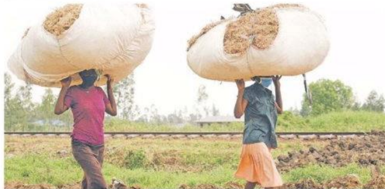
Women transport sugarcane waste to a company making briquet near Kibos shopping centre yesterday. The women are part of the labour force who work tirelessly to make fuel that is not harmful to the environment.